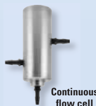
Continuous flow cell